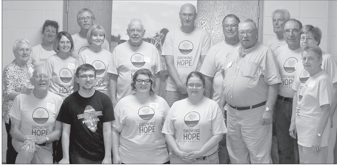
Local volunteers from Conrad and the surrounding areas were crucial to the success of the Growing Hope Globally conference.