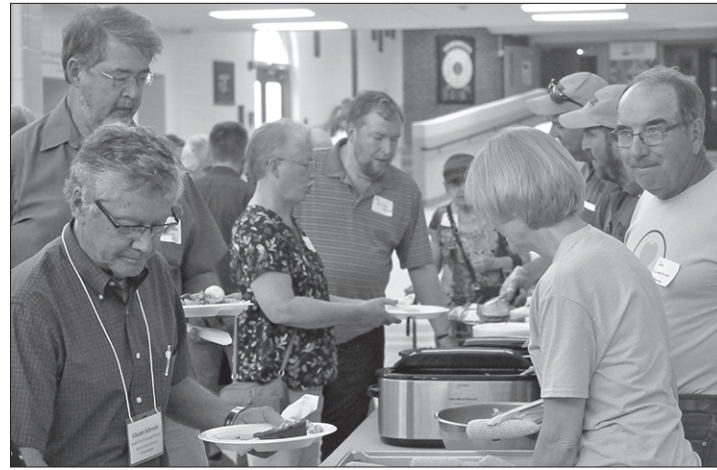
Visitors from around the nation and the world enjoyed a catered meal from PT Grillers on Saturday.

"The fact that they can tell the rest of the family, 'Come, we can host you,' that to me shows that this is a very accommodating society. It's a community that likes living a family life," she said. "They are an example to the rest of the world that yes, it is possible, and it is not good for people to die of hunger